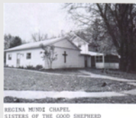
REGINA MINNIE CHAPEL, SISTERS OF THE GOOD SHEPHERD